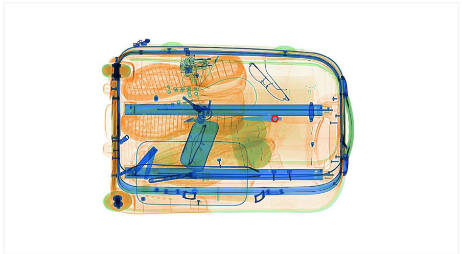
Figure 1: Example test image from the X-Ray Competency Assessment Test (CAT): a reliable, valid, and standardized certification test developed by CASRA.

The most recommendable method to assess X-ray image interpretation competency are computer-based tests. Although covert testing by in-