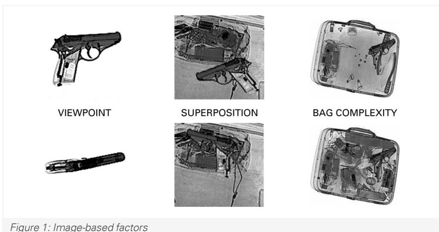
Figure 1: Image-based factors

The next step after the discovery of the image-based factors was to explore whether people differed in their abilities to cope with these factors. To this end, the X-Ray Object Recognition Test (X-Ray ORT) was developed ([1], [3]). The X-Ray ORT is a computer-based test and consists of 256 X-ray images. Only guns and knives have to be identified, due to the fact that the shape and appearance of these objects are known by most people, even if they have never worked with X-ray images before. Furthermore, all images are shown in black and white, since job applicants do not know the meaning of the different colors of real X-ray images. To measure the visual abilities of test candidates systematically, rotations of guns and knives showing familiar and unfamiliar viewpoints are used with little and much superposition by other objects in bags of low and high levels of bag complexity. In the test, each image is shown for four seconds on the computer screen because at rush hour, X-ray screeners often have only three to five seconds to visually inspect X-ray images. For each X-ray image, the test candidate has to decide whether